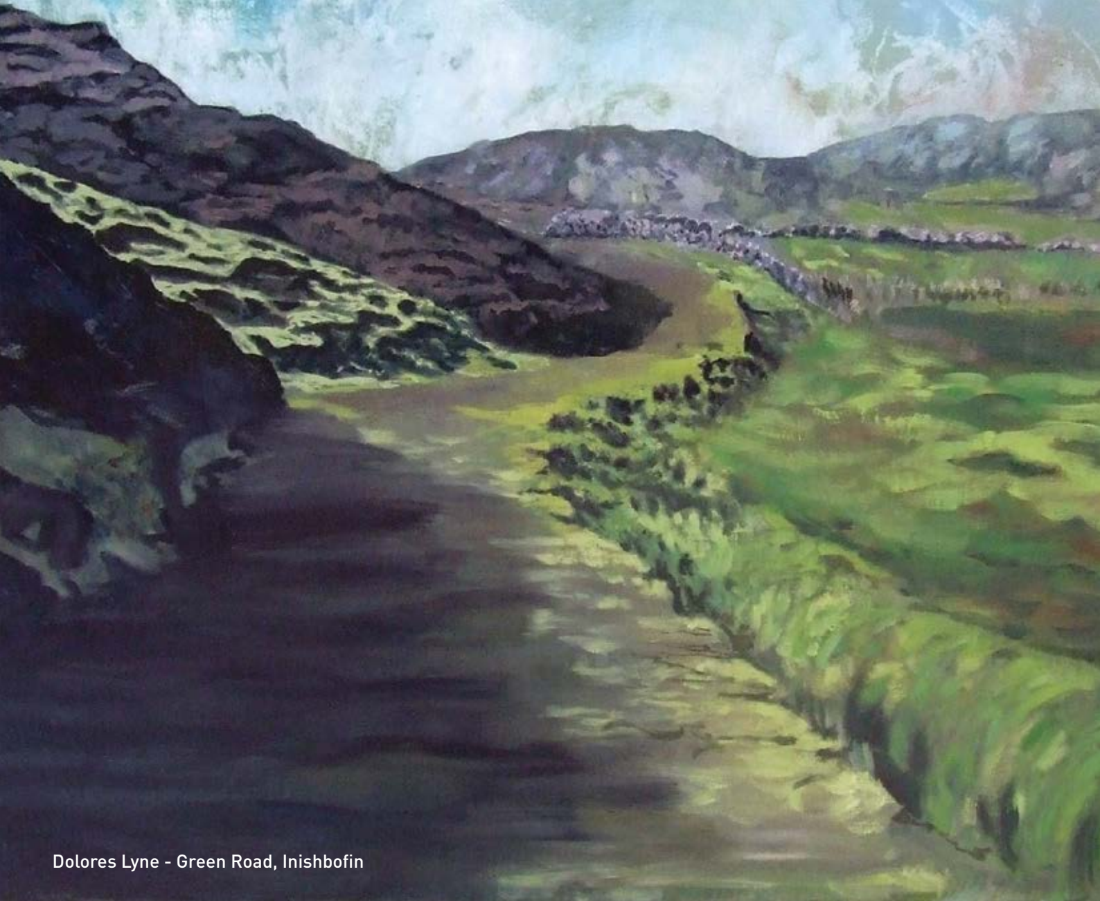
Dolores Lyne - Green Road, Inishbofin