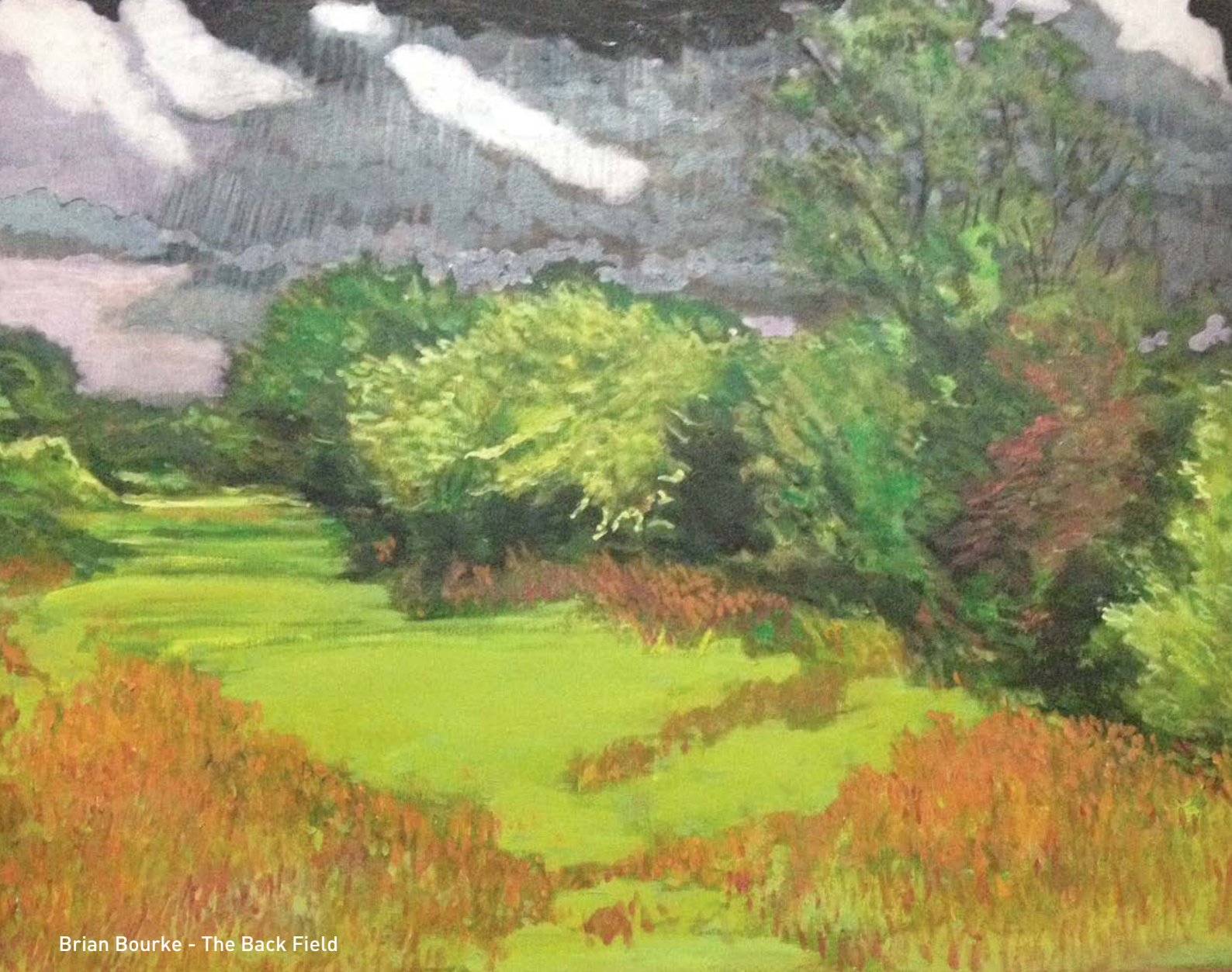
Brian Bourke - The Back Field