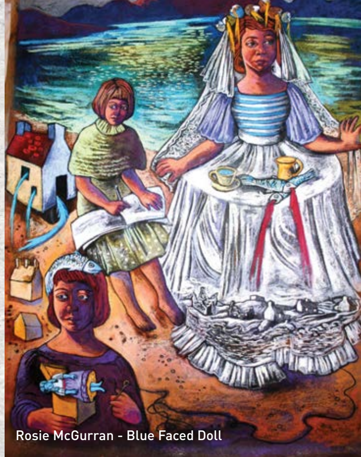
Rosie McGurran - Blue Faced Doll

10:00am - 10:30am Registration and Coffee