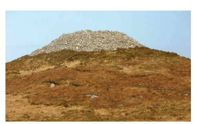
Carnseefin 1006 feet

Carnseefin ( Cairn Suidhe Finn —Carn of Finn's Seat) is in this townland. This large pile of stones at the top of the Glann Hill (1006 feet) is an ancient burial tomb probably a passage tomb dating to Bronze Age Period. It can be see from many places in Connemara and Mayo and East Galway. It is said that 8 counties are visible from Carnseefin as are the Aran Islands and the Burren.