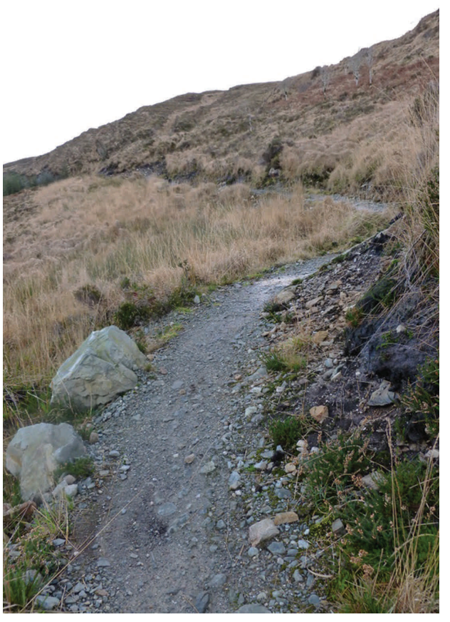
View from cycle track