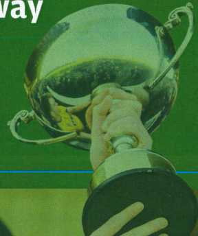
20 January 2019 - Enda Smith of Roscommon lifts the cup following the Connacht FBD League Final