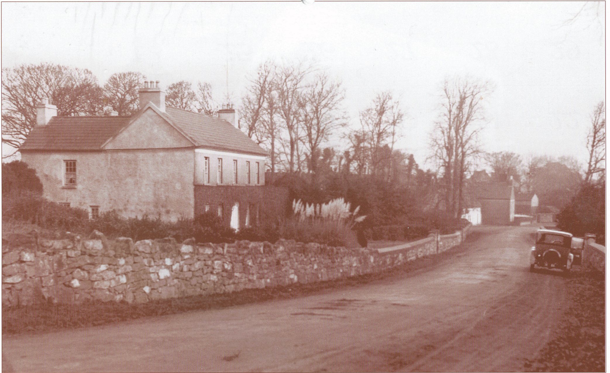
Circa 1934. On the approach from Connemara. Clareville House. This was the home of "Humanity Dick" Martin (1754-1834) founder of the I.S.P.C.A. The photograph shows the New Connemara Road, which was routed away from the rear of the house through the front garden dividing it in half in 1932.