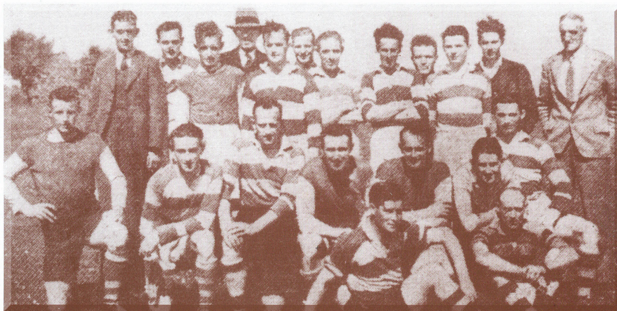
Members of the Oughterard 1938 County Senior Football Team