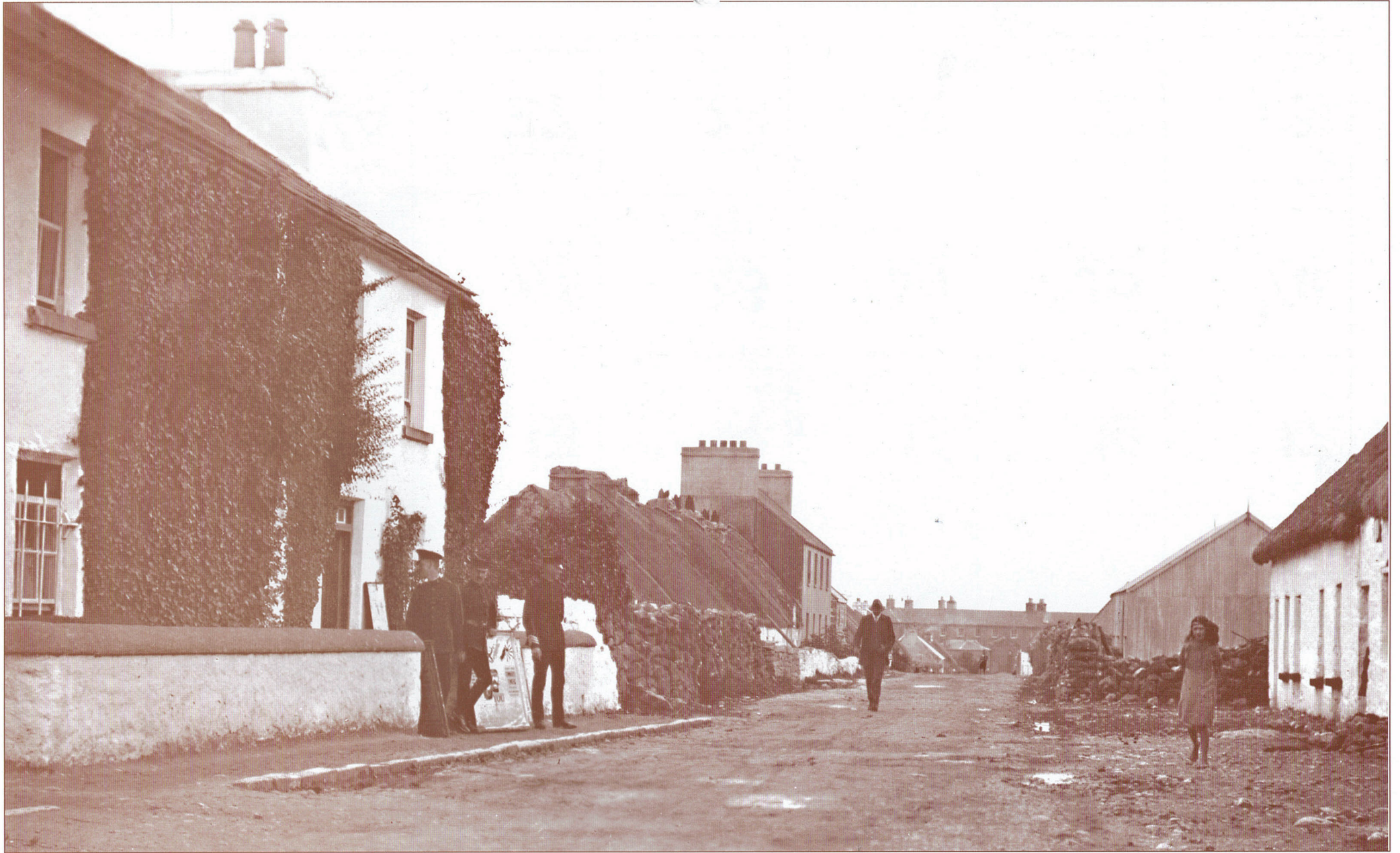
Circa 1921. Barrack Street (Camp Street), Oughterard. The British Army barracks can be clearly seen at the far end of the street and in the foreground on the left are the R.I.C. barracks.