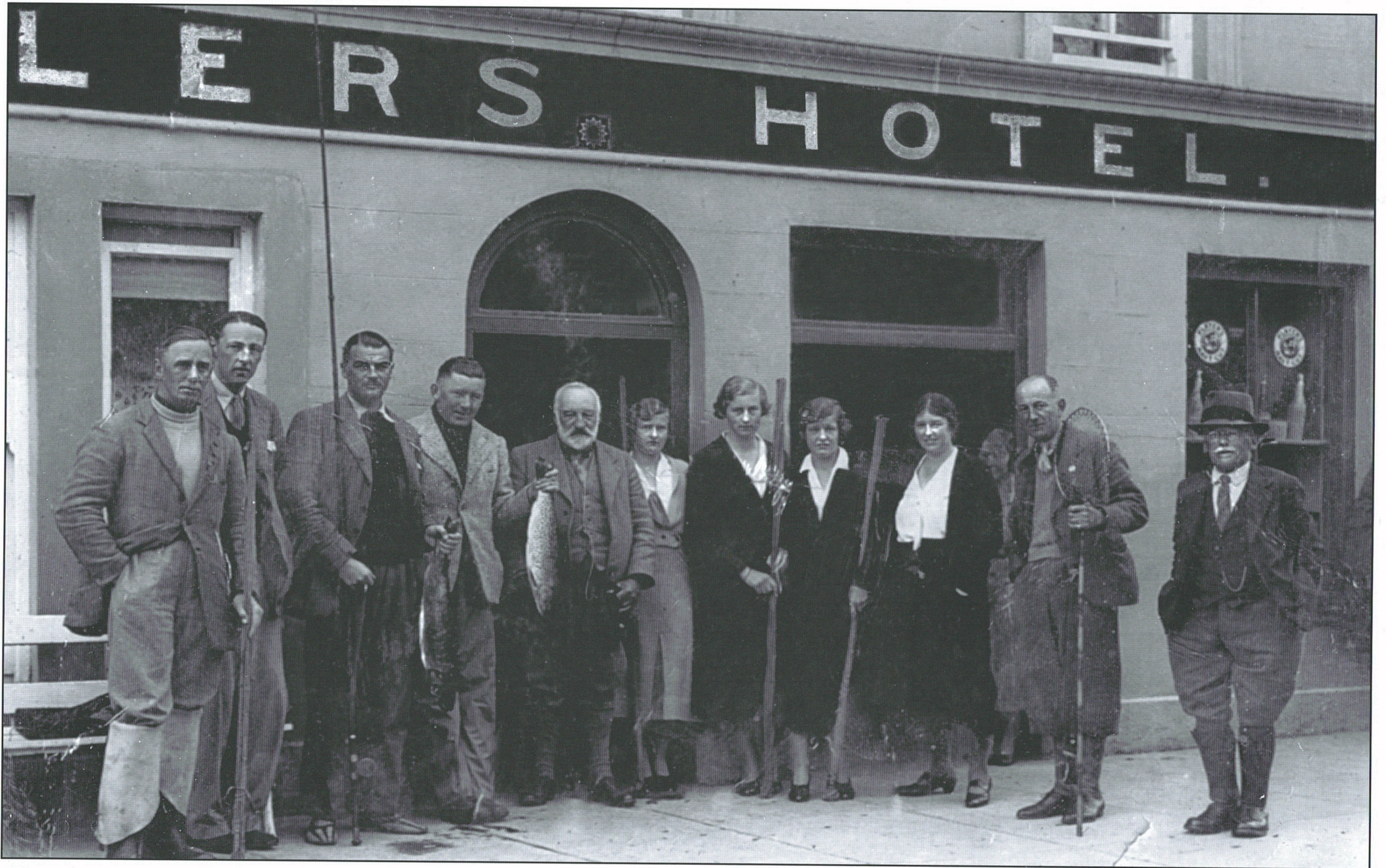
FISHERMEN AND STAFF OUTSIDE THE ANGLERS HOTEL