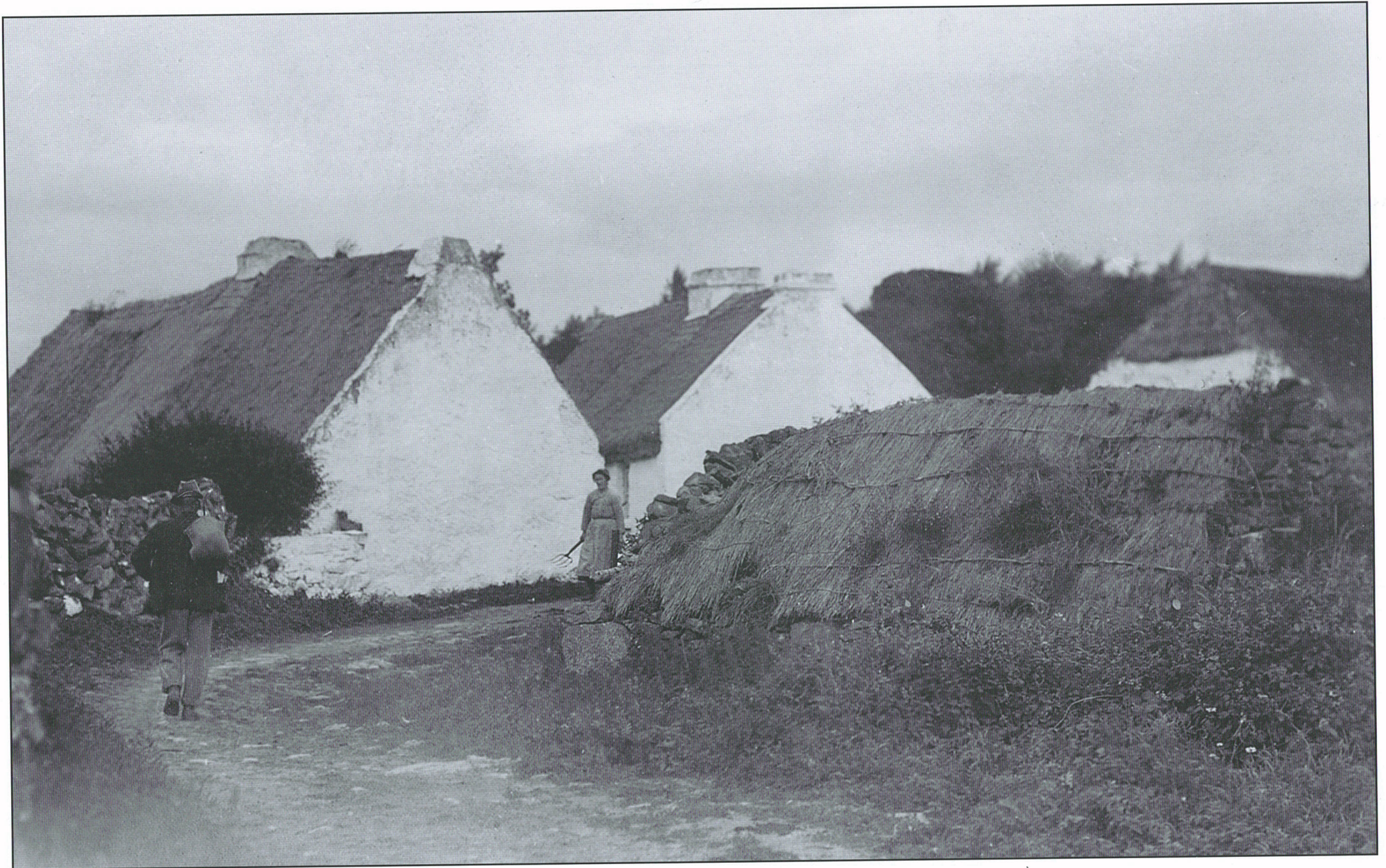
C.1900 CREGG, OUGHTERARD.

The 1901 census shows 188 residents in the townland and 273 residents, in the 1911 census.