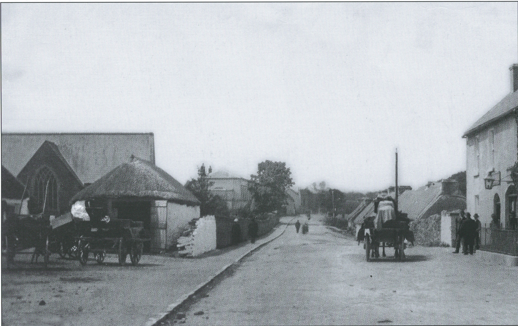
C.1870. BRIDGE STREET, OUGHTERARD.

On the left can be seen the thatched funeral house, as well as the Courthouse in the distance.