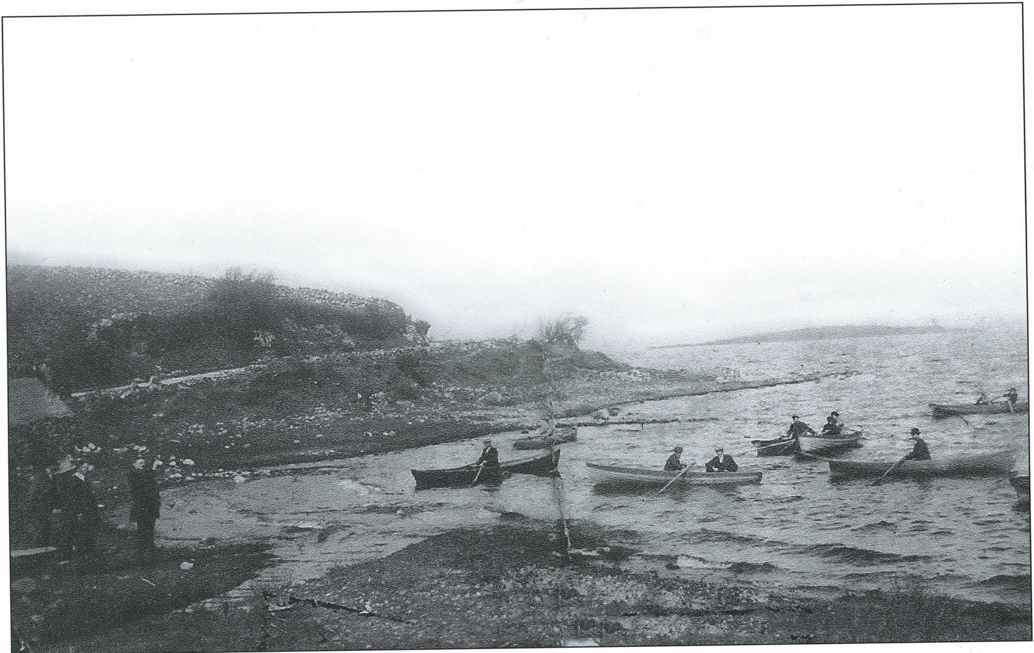
C.1890. BLESSING THE LOUGH CORRIB WATERS