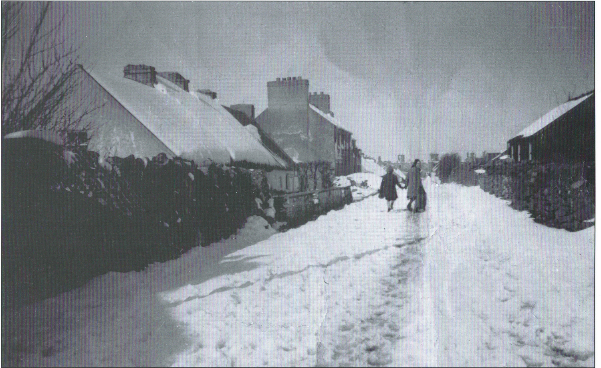
Camp Street 1947