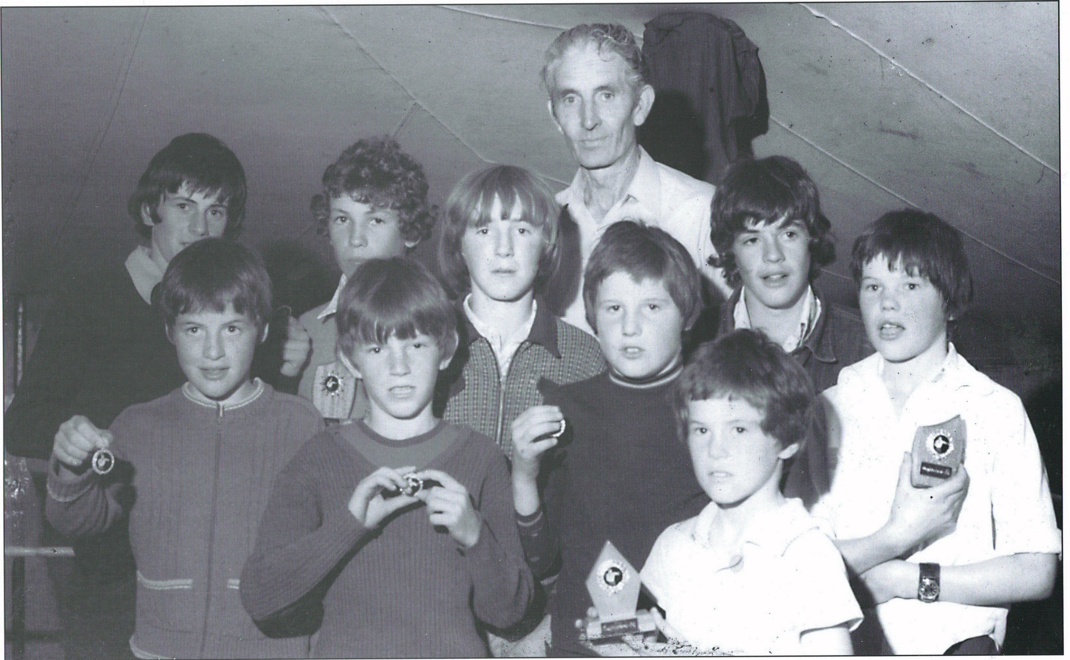
Boxing Club late 1970's