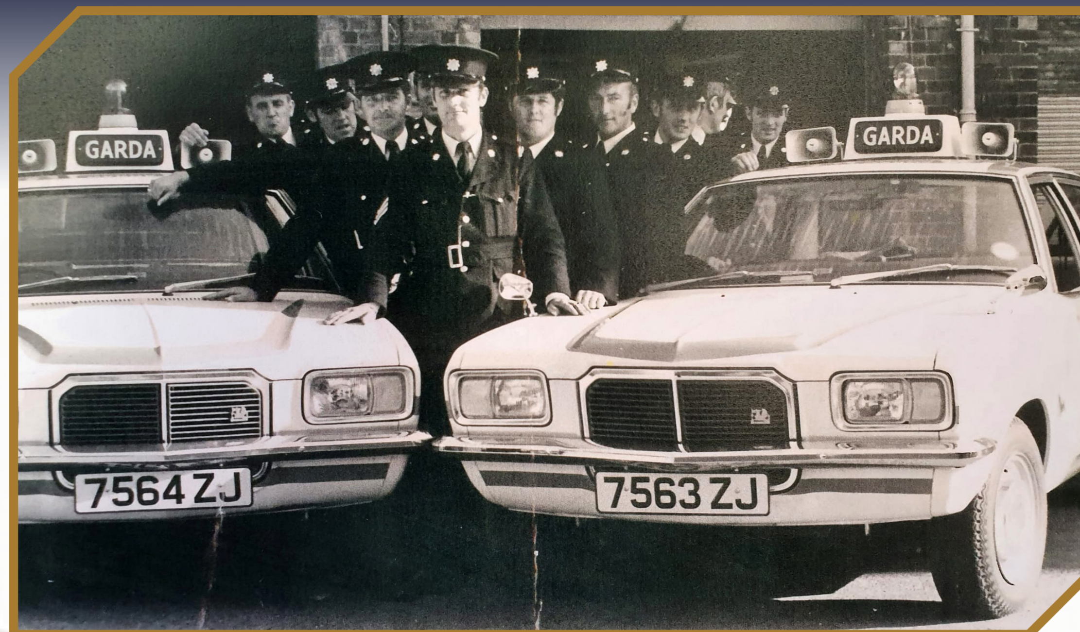
1 st Galway Divisional Garda traffic corps, 1973. An t-ú chór tráchtá den Gharda Síochána i Rannán na Gaillimhe, 1973.