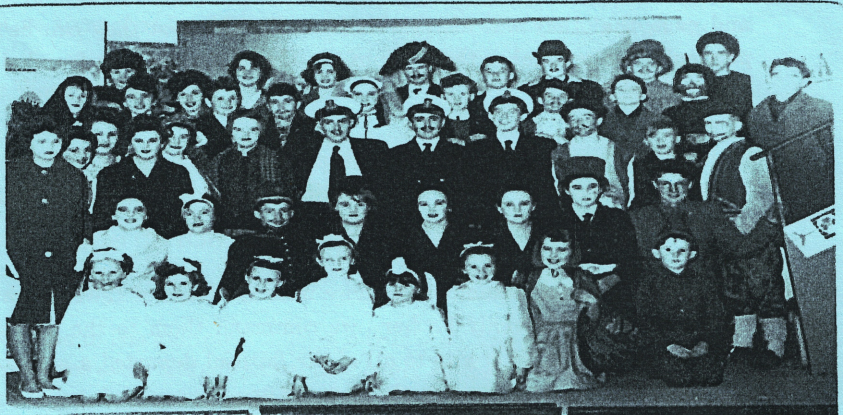
First Year Class of 1964